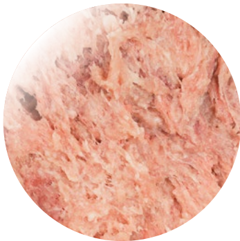
CHICKEN WHITE MEAT 601 - +- 2mm