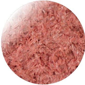
TURKEY RED MEAT 603 - +- 4 à 5mm