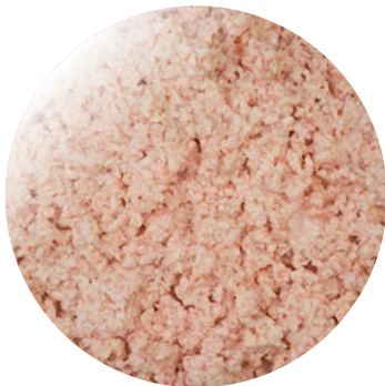
TURKEY SKIN BAADER 610 - +- 5mm