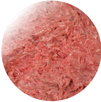
CHICKEN BAADER 605 - +- 4mm

Would you like to add more texture to your products? Look no further than Kipco-Damaco products. Our chicken Baader, turkey red meat and chicken white meat are top of the line. With texture from 4-5 mm, they are perfect for meatballs, hamburger patties and a must for medium-fine sausages. Among the right combination of our Kipco-Damaco MDM, Baader or other meat types, your products will reach a level of quality that will satisfy any market demands.