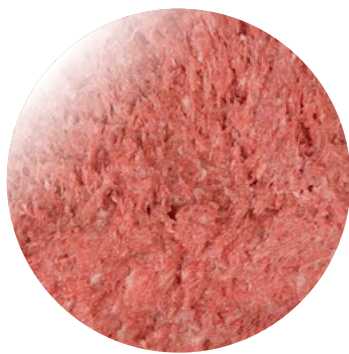
CHICKEN MDM 601 - +/- 2mm

Kipco-Damaco uses a special soft production method to produce mechanically deboned meat (MDM) with a texture of +/-2 mm. This process guarantees the protein level of our MDM chicken and MDM turkey, making them suitable as stand-alone products, or for combining with other Kipco-Damaco products, such as Baader meat. As this production process also promotes binding and water absorption, our MDM meats are perfect for use in frankfurters, mortadella, nuggets, as well as canned and luncheon meat products.