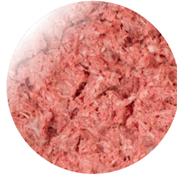
POULTRY BONECAKE 611