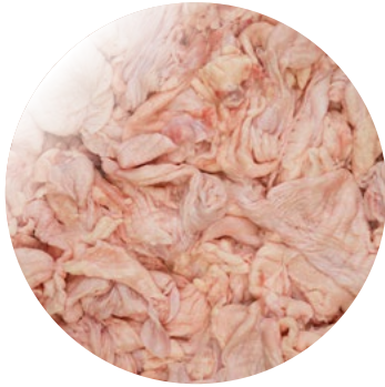
CHICKEN SKIN 607

Is the binding in your product as effective as it could be? The right turkey or chicken skin contains the high level of proteins and collagen needed to help binding. And it's full of flavour. Working with these raw, natural materials also drives costs down. The definition of a win-win situation!