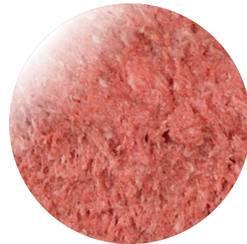
WHITE CHICKEN BAADER 602 - +- 2mm