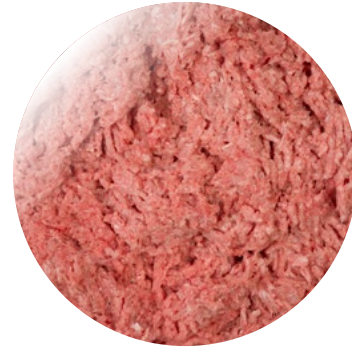
TURKEY BAADER 604 - +- 4mm