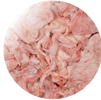
TURKEY SKIN 608